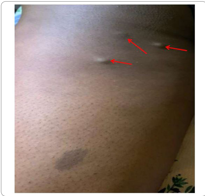
Figure 1: Nodular lesions of varying sizes (red arrows) with a hyperpigmented patch on the posterior thigh.

An initial clinical diagnosis of Neurofibromatosis (Type 1) was made.